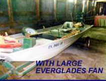
WITH LARGE EVERGLADES FAN

NEW ADDED INVENTORY X4 W 4560 Backhoe • 8 X 8 Cattle Feeder Trailer Wood Lathe • Tractor Added ) * 10% ADDED. ALL ITEMS THERE ARE NEW Volvo semi w/16' Air boat, V front end rake, wheel driven. Ontario 13 hole grain drill, 2 Row corn planter as-is. 3PH hand made PTO wrench for hauling logs. Bronco rotary 3 PH seeder, HID power pack unit for a log splitter. Wood lathe w/cutting tools, 10 HP generator, Craftsman shaper, new Speedaire compressor, 12" Ridgid table saw, Sears drill press, Farmhand 7HP 60 GAL air compressor, Smithy lathe w/pedestal attachment, Craftsman 15" drill press, Ridgid floor jack/planer, barn fan, Sears tool chests, steel fence posts, 7" metal band saw, 225 Lincoln welder w/rebuilt engine, back pack sprayer, new large just new air tank, all power, hand and utility tools. Everything in excellent condition! Like-New Maytag washers, furnace, central air unit, new Whirlpool electric water heater, Sportsman egg incubator. Terms: All items sold as-is. A 10% buyer's premium added. Must be paid for, in full, on the day of the auction. Mastercard & visa accepted (3% additional buyer's premium added).